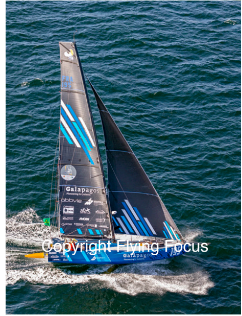
Photonr. 131999 Reg. Name Galapagos Location Fastnet Client Freelance Rec. date Jul, 24, 2023