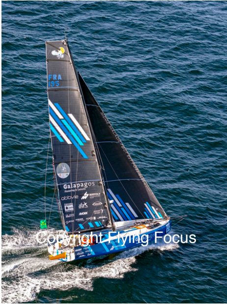
Photonr. 131998 Reg. Name Galapagos Location Fastnet Client Freelance Rec. date Jul, 24, 2023